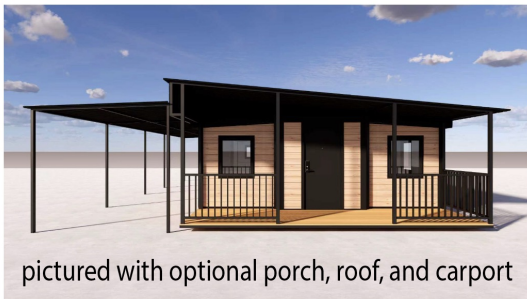
pictured with optional porch, roof, and carport