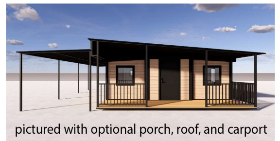
pictured with optional porch, roof, and carport